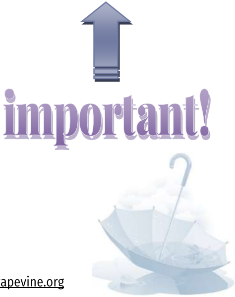
Umbrella image courtesy of the AAGrapevine: aagrapevine.org