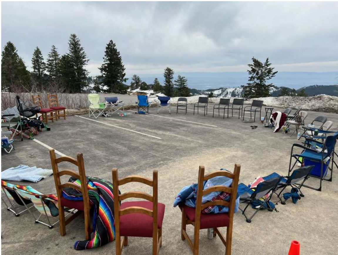
The view after the 7am Zoomers annual Bogus Basin BBQ on March 27th. Great turnout, and a good time was had by all!